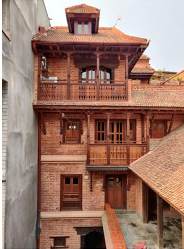
Project Name: Sikami Chhen Location: Kathmandu, Nepal

The heroic reconstruction of the Sikami Chhen, built on the premises of a 200-year-old residence within the Kathmandu Valley World Heritage town of Bhaktapur, stands as an inventive and culturally authentic response to the devastating impact of the 2015 Gorkha earthquake. Following the demolition of the original building due to irreparable structural instability, the owner-artisans adroitly adapted age-old building techniques, using their traditional knowledge of brick and timber-frame architecture, to design a new house that meets the stringent safety regulations now governing the construction of new private residences in Nepal. Integrating modern craftsmanship such as steel-reinforced brick masonry into the vernacular architectural vocabulary, the newly-built Sikami Chhen prioritizes seismic protection while preserving the unique character of Bhaktapur's historic architecture. The family of woodcarvers continues to perform and showcase the transformative practice of Bhaktapur's woodcarving tradition at the in-situ workshop. The project has enhanced the overall well-being of the community, creating a safer, more resilient, and culturally enriched addition to the town's built environment, and providing a viable example for a heritage-based approach to modern construction at other earthquake-affected historic districts in the region.